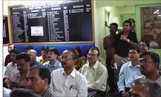
Clinical meeting at IADVLWB