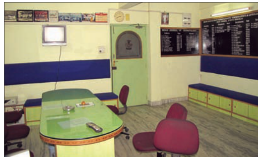
IADVL WB New off ce at 62, Lenin Sarani

an open access online version with full text for free.