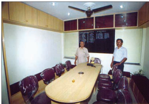
Old off ce of IADVL-WB branch at 53 Creek Row (2001)