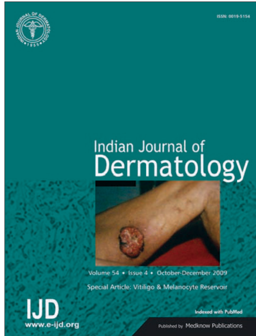
IJD 2009 Oct-Dec_cover