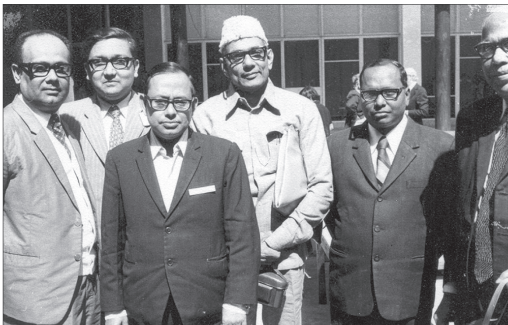
Delegates to the 1976 Delhi National Conference