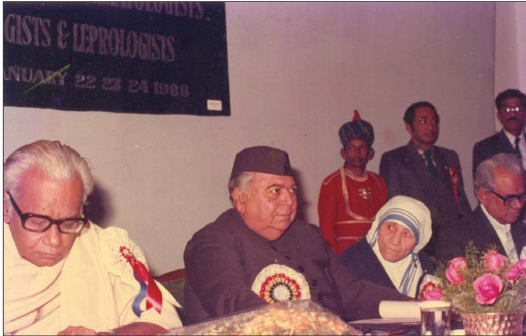
Mother Teresa and Governor, Professor Nurul Hasan (Centre) at the inaugural function of the National Conference at Calcutta in 1988

decades now since the early sixties of last century. Indian Journal of Dermatology