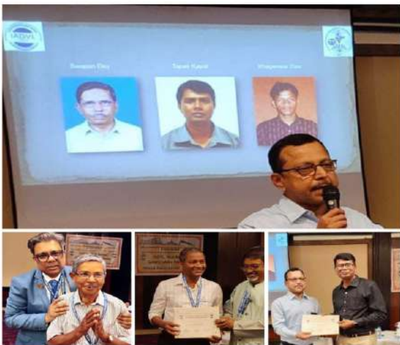
felicitation of dedicated staffs of IADVL WB